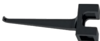
Haken, 1-zahnig, 1,8 mm Hook blade, 1 teeth, 1.8 mm