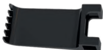
Valve 6-zahnig, 27 mm breit Blade, 6 teeth, 27 mm