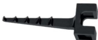
Mehrzahn-Haken, 2 mm Multiple toothed hook, 2.0 mm