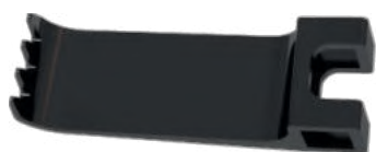
Valve 4-zahnig, 20 mm breit Blade, 4 teeth, 20 mm